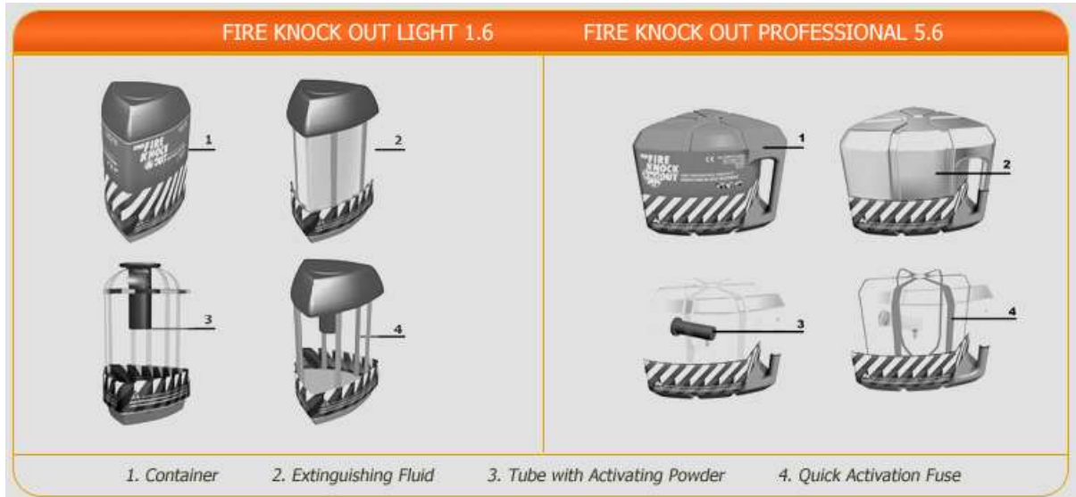
Figure 3.1 Table of contents within Fire Knock Out

Figure 3.1 displays the contents within the Fire Knock Out Models. Due to the packing being hermetically dust-proof and moisture-proof, maintenance on the Fire Knock Out models is limited to a periodical visual inspection.