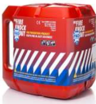
Figure 1.2 Fire Knock Out 5.6 Model

The Fire Knock Out (FKO) has a special feature: it automatically starts to operate when it comes into contact with open fire and then fights the seat of a fire within a few seconds. The plastic container is filled with a harmless fire extinguishing fluid and activation (powder) material, on which a quick fuse is fitted.