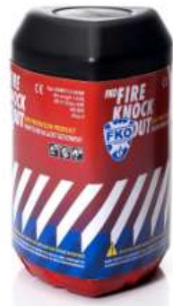
Figure 1.1 Fire Knock Out 1.6 Model

As soon as the fuse comes into contact with open fire, the container splits open. During a short moment all oxygen in and around the seat of the fire is removed, as a result of which the fire is fought immediately.